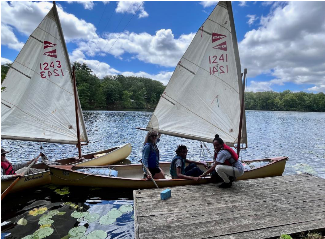
Lake Sebago Open Sail July 2023

More information and Directions to the camp are available from http://aca-atlanticdivisionblog.com/